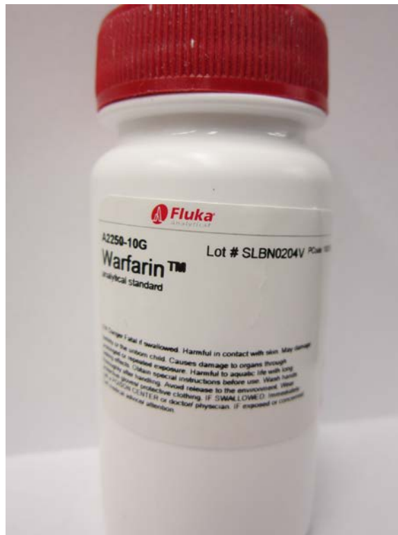
Figure 2: Warfarin in Fluka container.