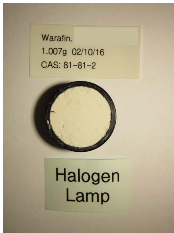
Figure 3: Warfarin sample loaded in IR sample cup.