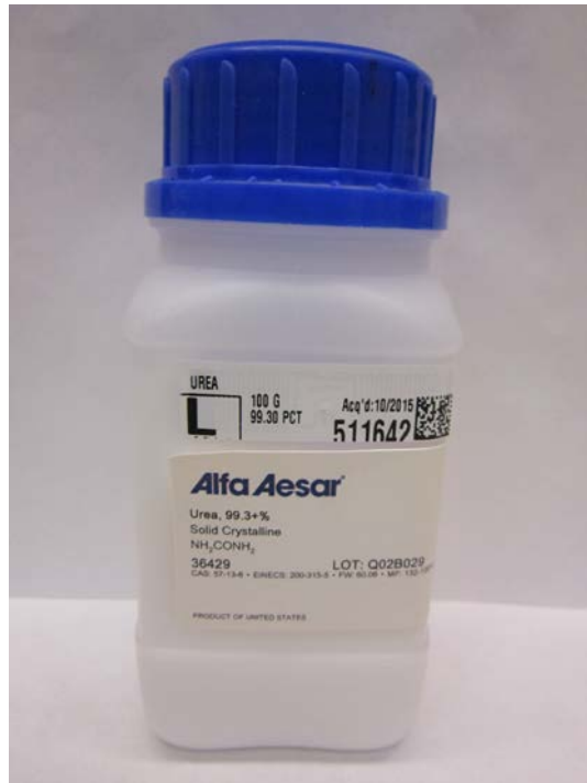
Figure 2: Urea in Alfa Aesar container.