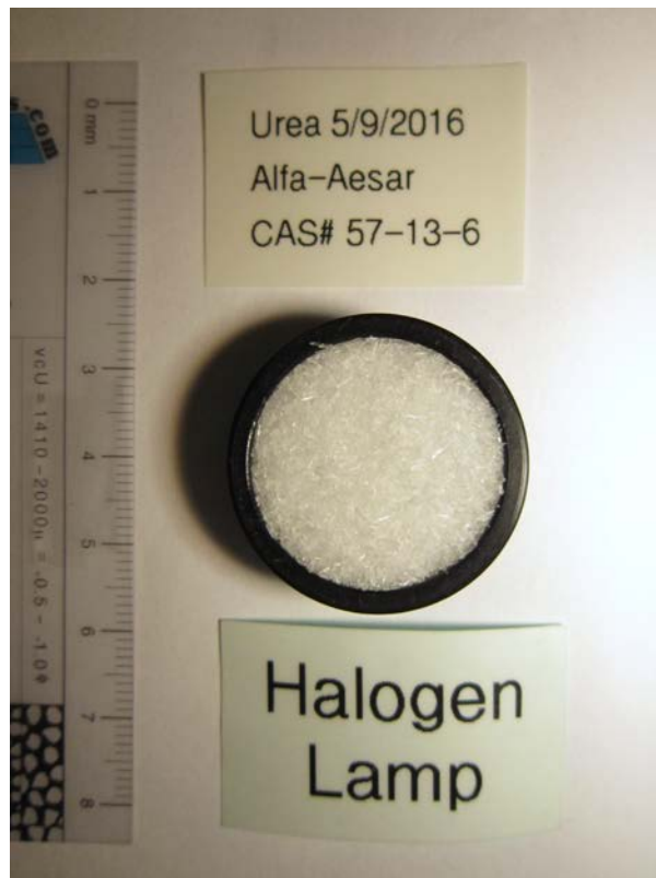
Figure 3: Urea loaded in IR sample cup.