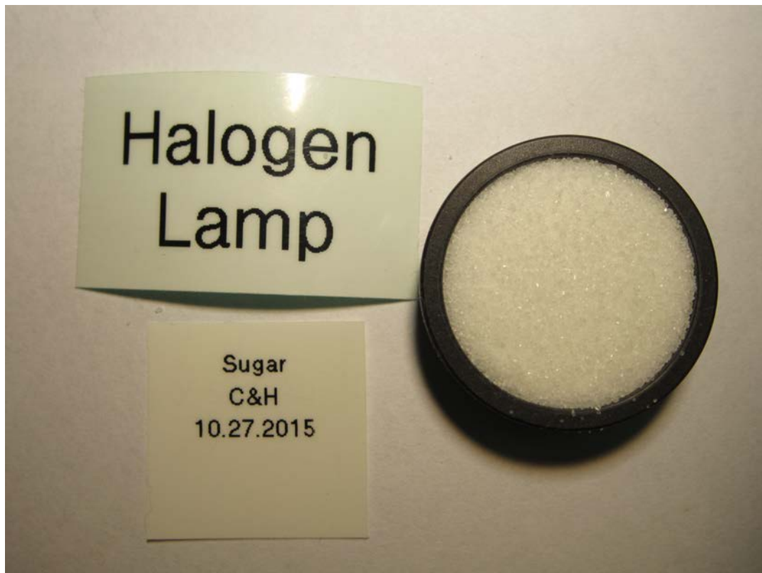
Figure 3: C&H sugar loaded in IR sample cup.