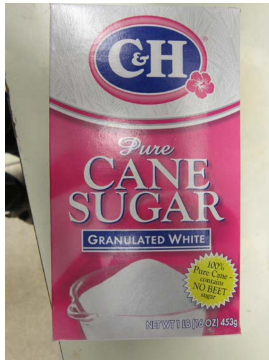
Figure 2: Cane sugar in commercial C&H container.