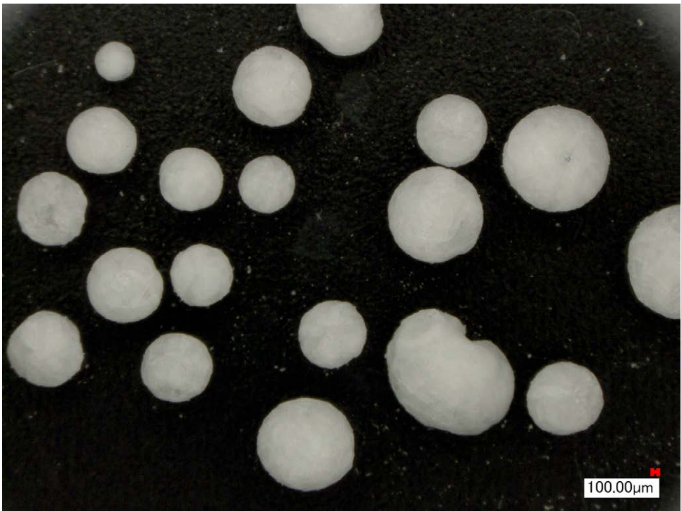
Figure 4: Photomicrograph of Sebacic acid.

A Keyence VHX-1000 digital microscope with 16-bit resolution is used to provide photomicrographs of the various samples and particle sizes. Software included with the microscope differentiates the brightness and colors in the image and extracts the bright objects to produce a binary image. The software assumes all adjacent bright points are part of the same object then calculates the area for each of these objects. The area (A) is used to calculate the mean particle diameter (d) by assuming the particles are spherical and using the relationship d = \sqrt{4A/\pi} . Although the assumption of spherical particles is clearly not always valid, this procedure provides a reasonable estimate of the mean particle size.