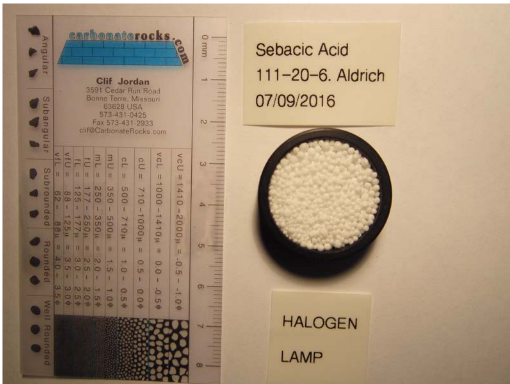
Figure 3: Sebaccic Acid loaded in IR sample cup.