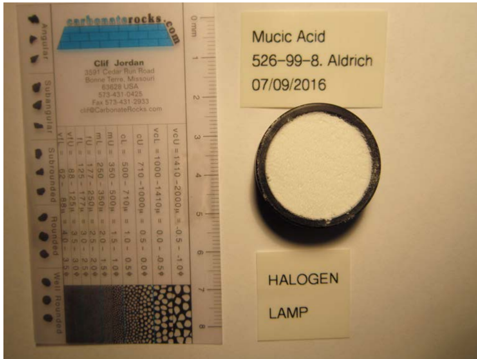
Figure 3: Mucic Acid loaded in IR sample cup.