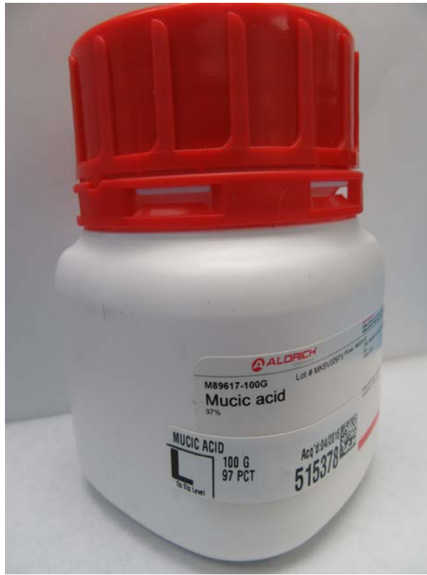
Figure 2: Mucic acid in Aldrich container.