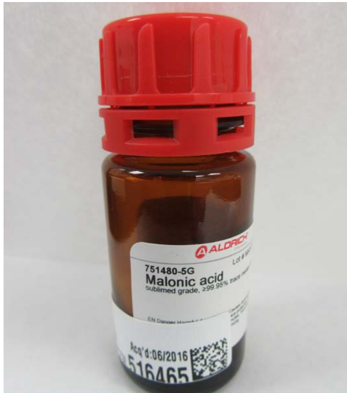
Figure 2: Malonic acid in Aldrich container.