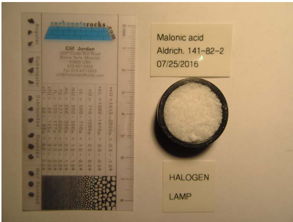
Figure 3: Malonic acid loaded in IR sample cup.