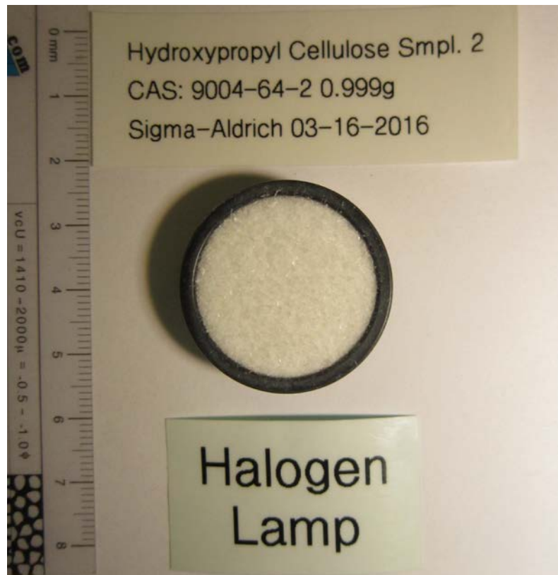
Figure 3: Hydroxypropyl Cellulose loaded in IR sample cup.