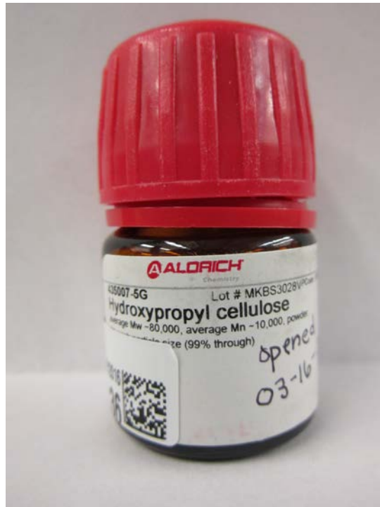
Figure 2: Hydroxypropyl Cellulose in Aldrich container.