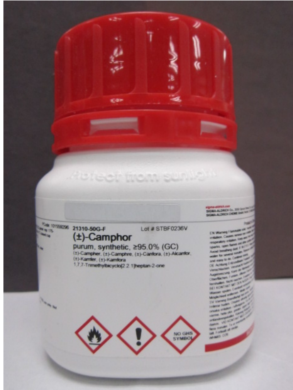
Figure 2: Camphor in Sigma-Aldrich container.