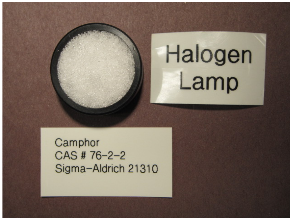
Figure 3: Camphor loaded in IR sample cup.