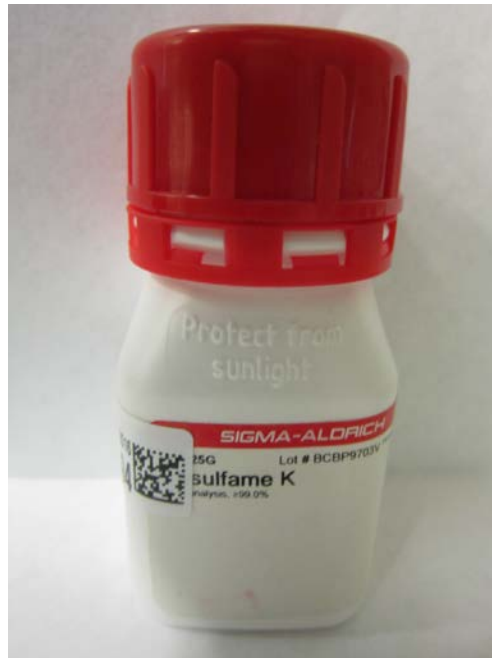
Figure 2: Acesulfame K in Sigma-Aldrich container.