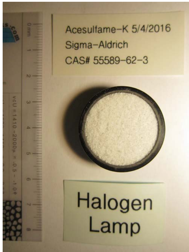
Figure 3: Acesulfame K loaded in IR sample cup.