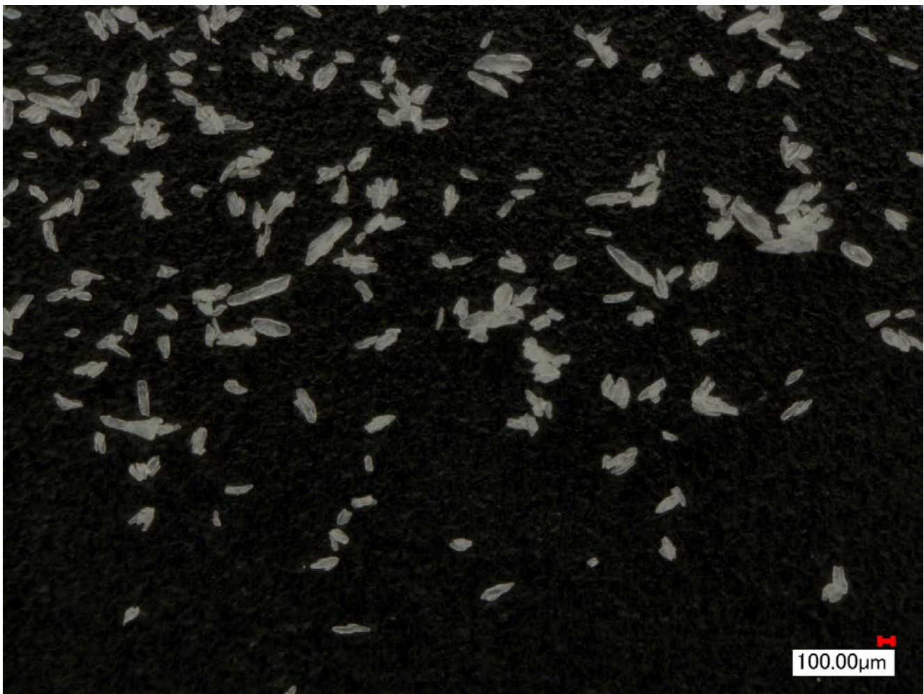
Figure 4: Photomicrograph of 2-Furoic acid.

A Keyence VHX-1000 digital microscope with 16-bit resolution is used to provide photomicrographs of the various samples and particle sizes. Software included with the microscope differentiates the brightness and colors in the image and extracts the bright objects to produce a binary image. The software assumes all adjacent bright points are part of the same object then calculates the area for each of these objects. The area (A) is used to calculate the mean particle diameter (d) by assuming the particles are spherical and using the relationship d = \sqrt{4A/\pi} . Although the assumption of spherical particles is clearly not always valid, this procedure provides a reasonable estimate of the mean particle size.