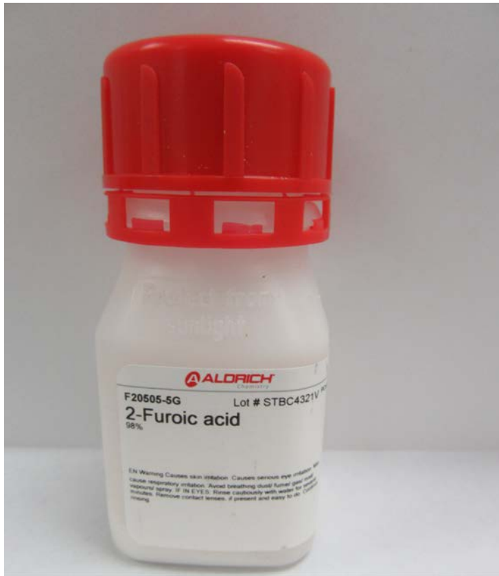
Figure 2: 2-Furoic acid in Aldrich container.