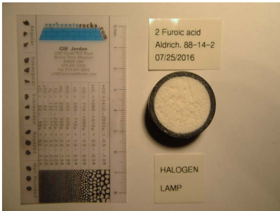
Figure 3: 2-Furoic acid loaded in IR sample cup.