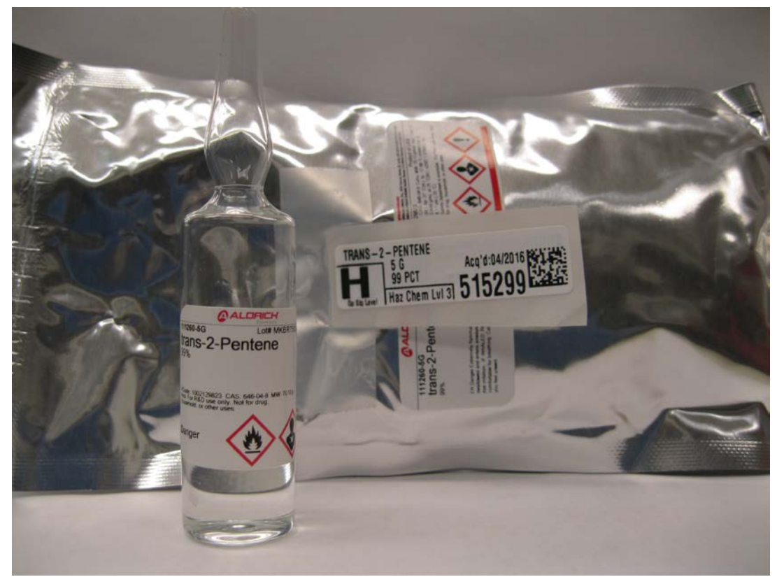
Figure 2: trans-2-Pentene in Aldrich container.