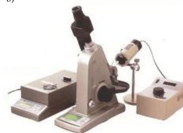
Figure 1: The Bruker Tensor 27 FTIR (a) and Abbe refractometer (b).