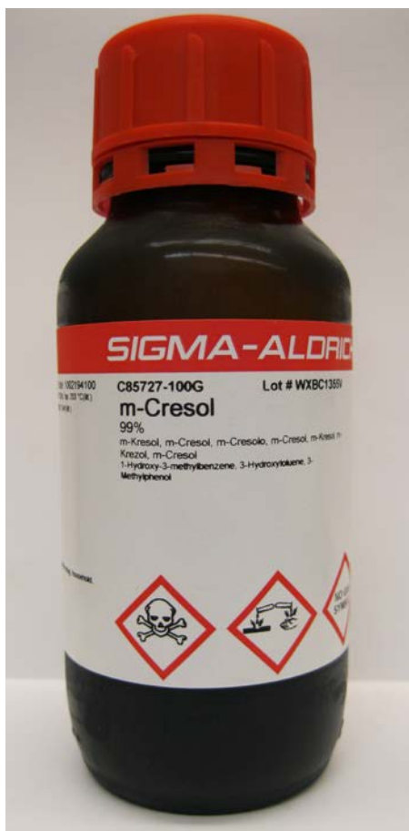
Figure 2: m-Cresol in Sigma-Aldrich container.