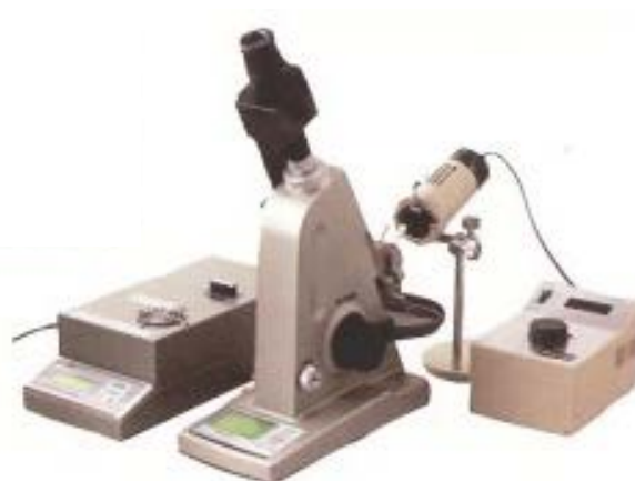
Figure 1: The Bruker Vertex 70 FTIR (a) and Abbe refractometer (b).