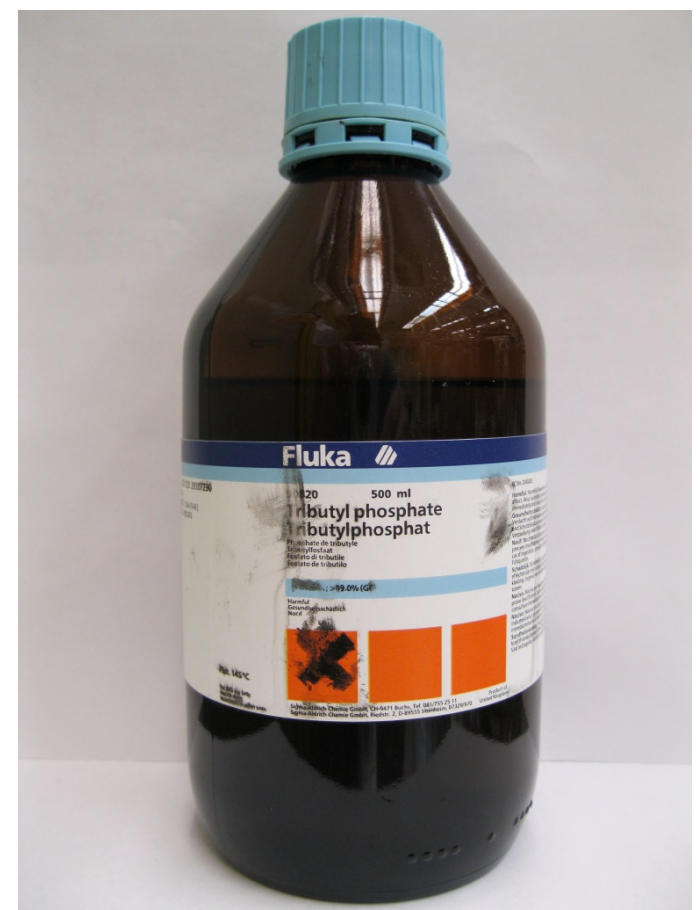
Figure 2: Tributyl phosphate in Fluka container.