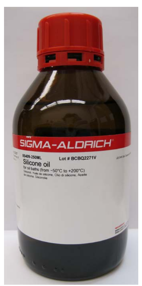
Figure 2: Silicone oil in Sigma-Aldrich container.