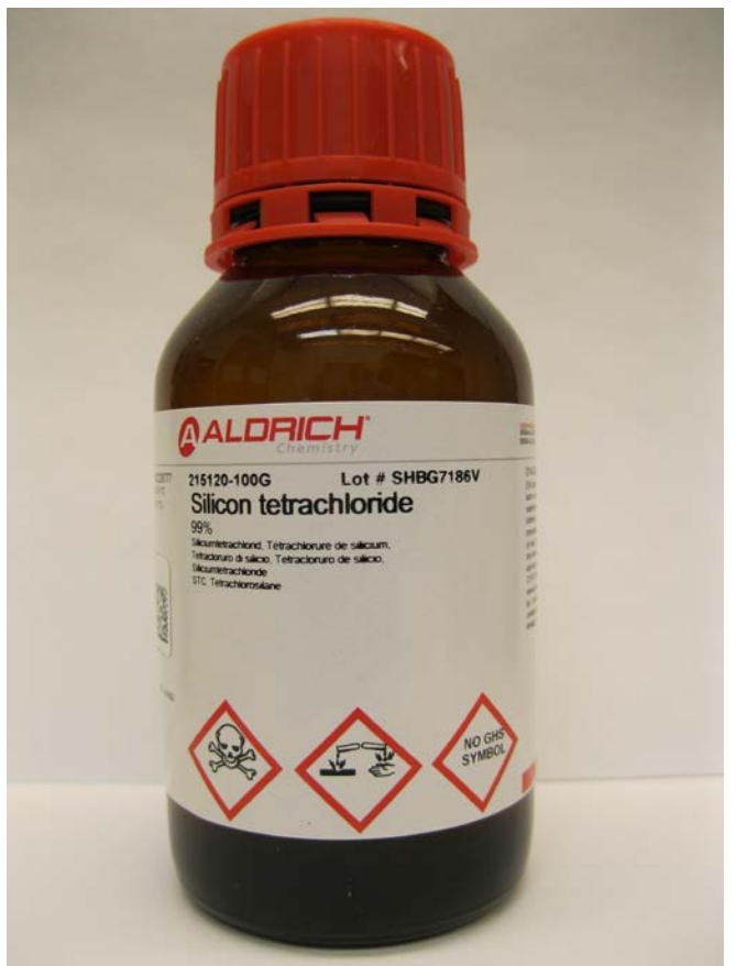
Figure 2: Silicon tetrachloride in Aldrich container.