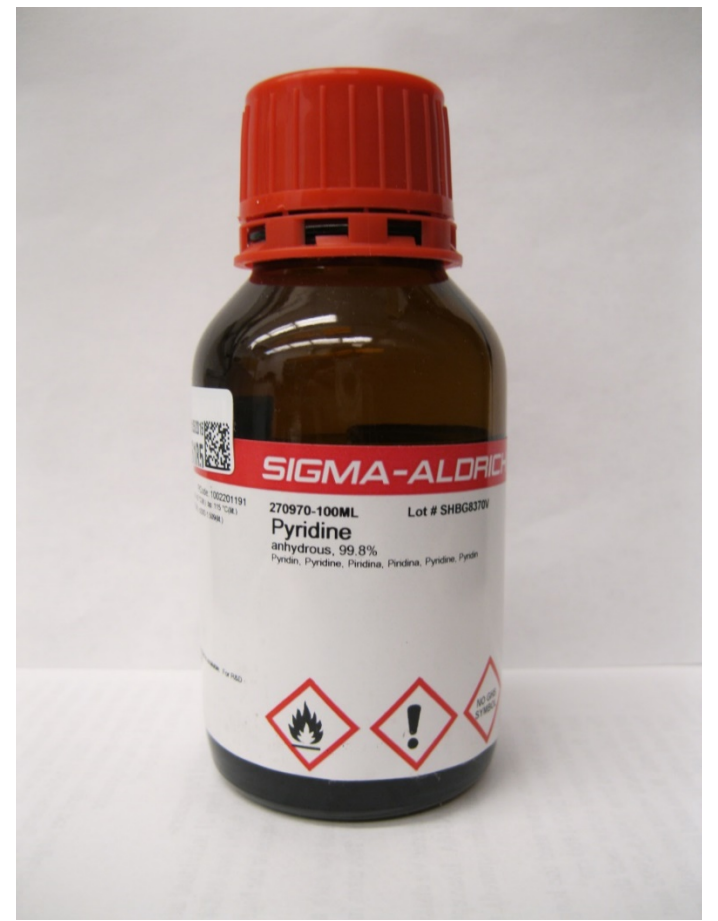
Figure 2: Pyridine in Sigma-Aldrich container.