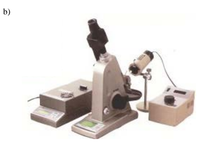
Figure 1: The Bruker Vertex 70 FTIR (a) and Abbe refractometer (b).