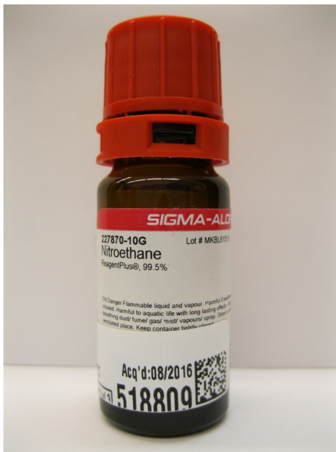
Figure 2: Nitroethane in Sigma-Aldrich container.