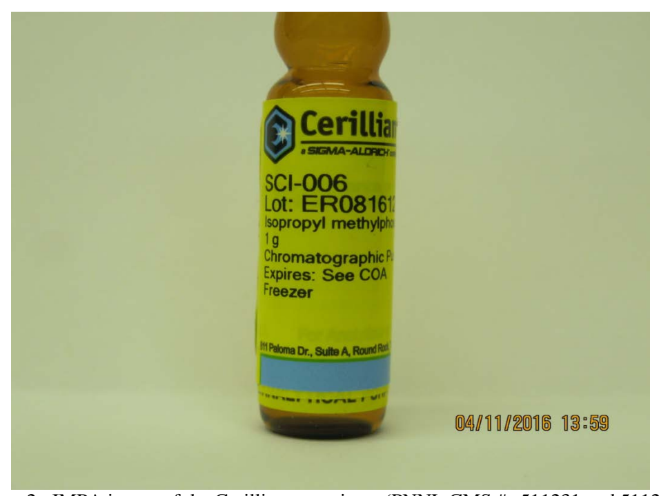
Figure 2: IMPA in one of the Cerilliant containers (PNNL CMS #s 511231 and 511232).