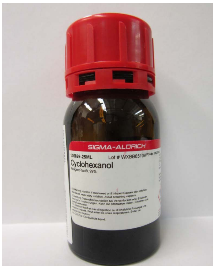
Figure 2: Cyclohexanol in Sigma-Aldrich container.