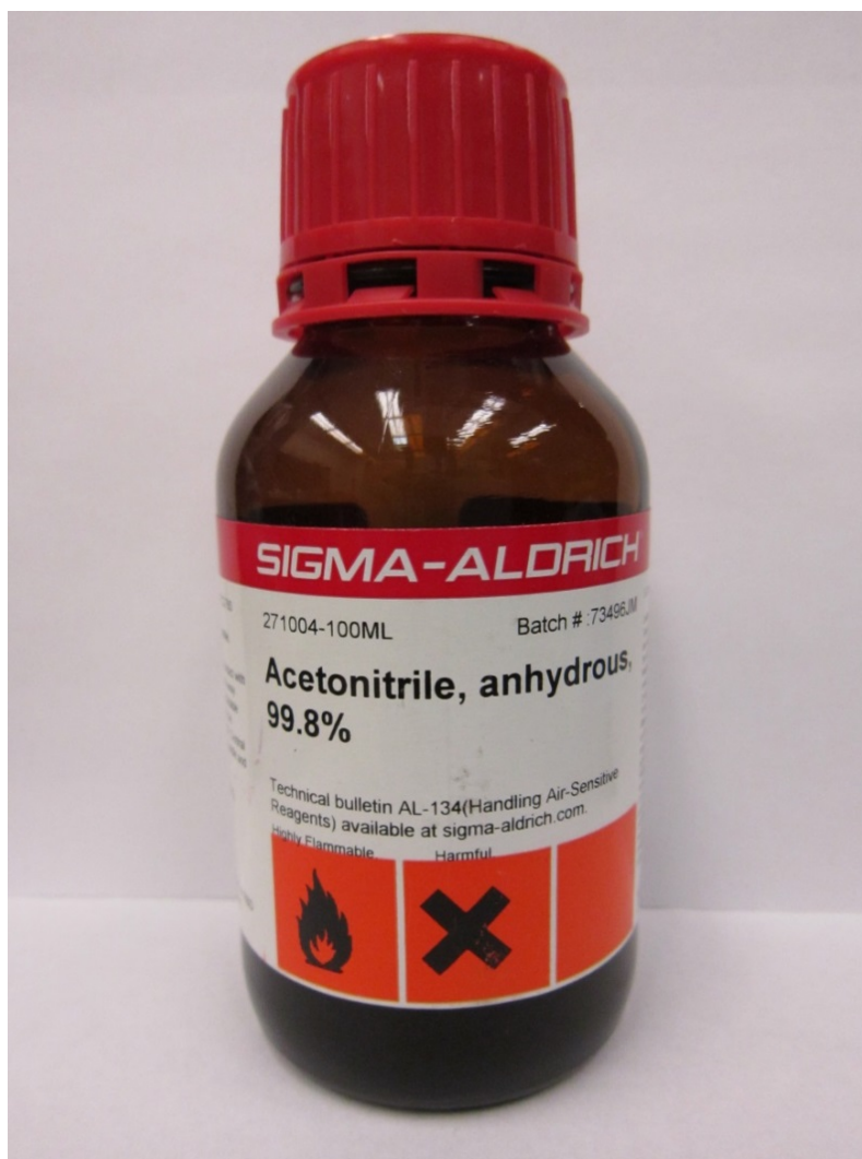
Figure 2: Acetonitrile in Sigma-Aldrich container.