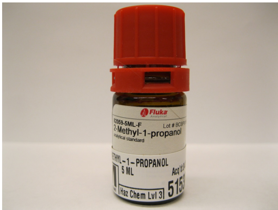
Figure 2: 2-Methyl-1-propanol in Fluka container.